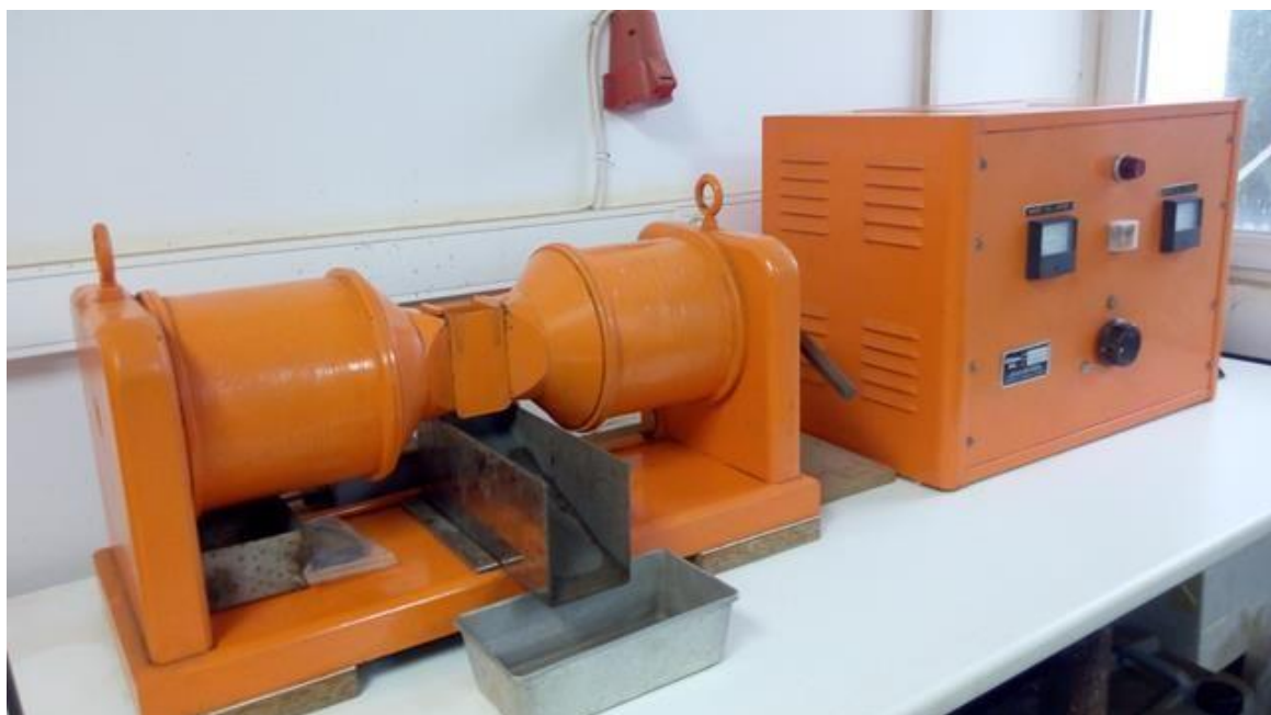
High intensity wet magnetic separator (Carpco)