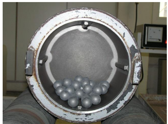
Rod mill - Ball mill (Sepor)