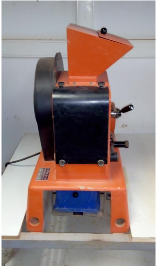
Jaw crusher (Fritsch)