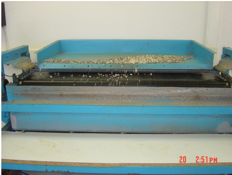
Perm Roll belt magnetic separator (Inprosys)