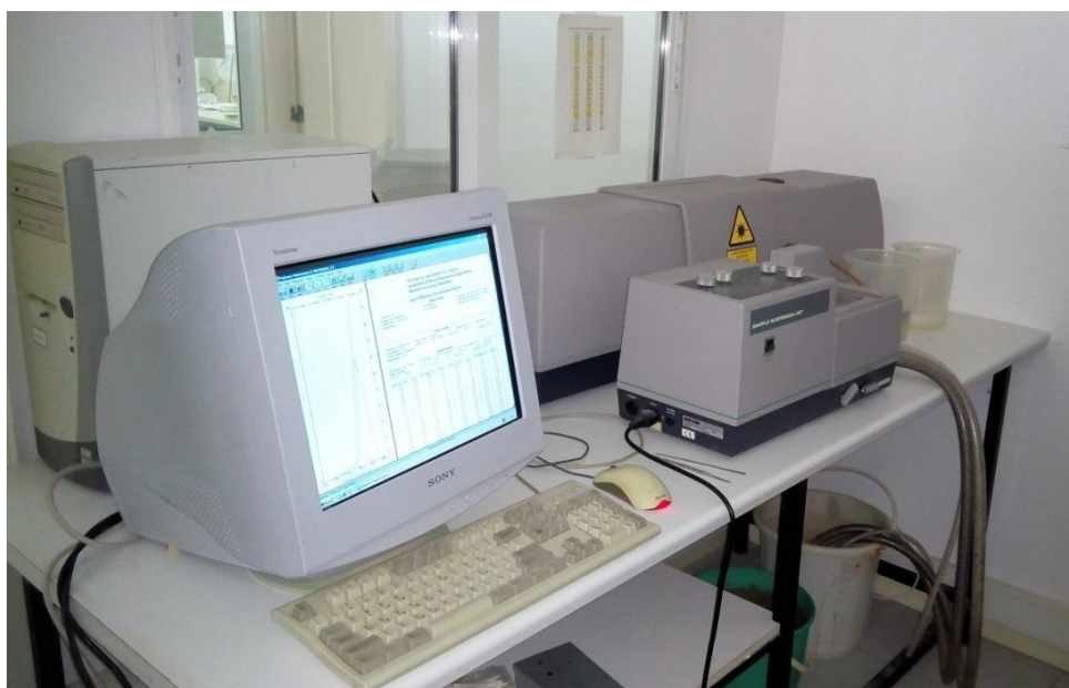
Laser diffraction particle size analyzer (Mastersizer S - Malvern Instruments)