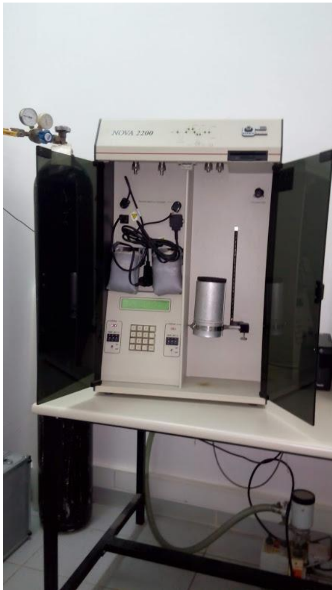
Gas Sorption Analyzer (NOVA 2200 - Quantachrome)