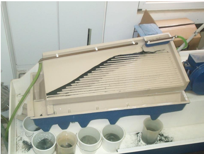
Wet gravity shaking table (Wilfley)