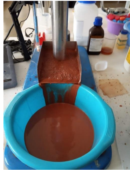
Laboratory flotation machines (Denver)