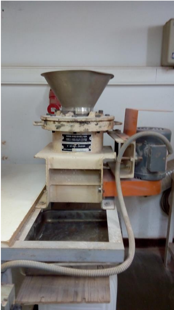
Cone crusher (Sepor)