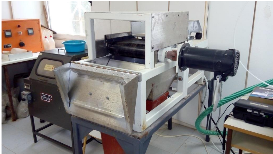
Perm Roll belt magnetic separator (AKSA Magnet)